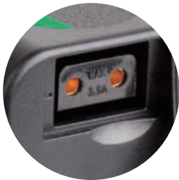
14.4V D-tap output