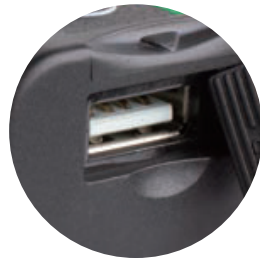
5V/2A USB output