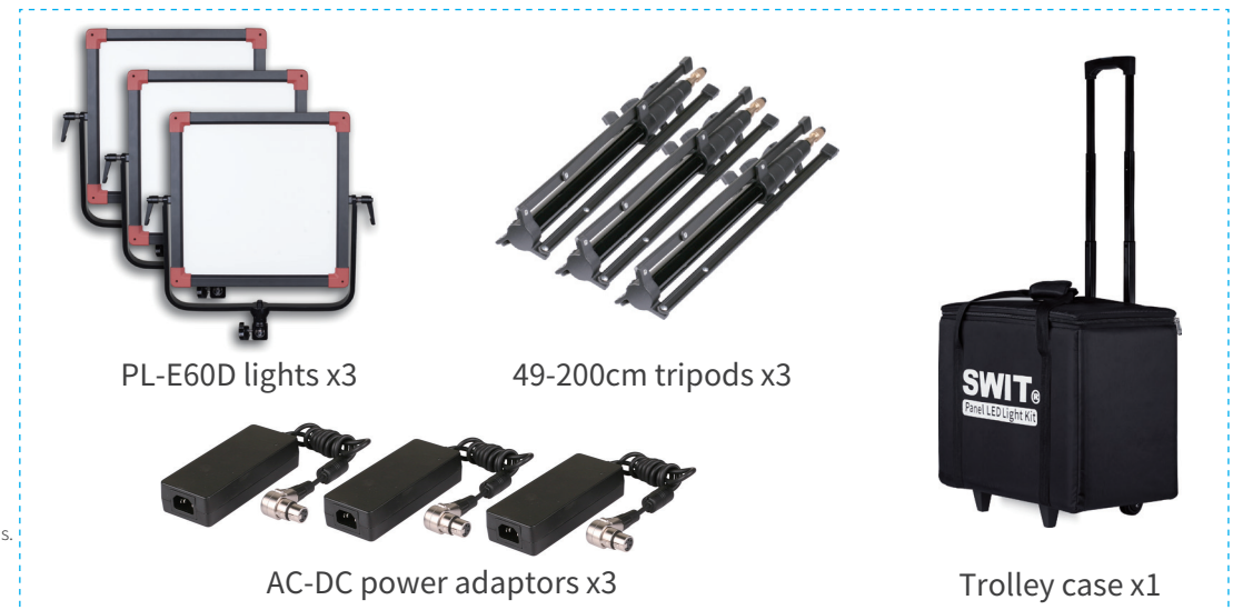
PL-E60D lights x3